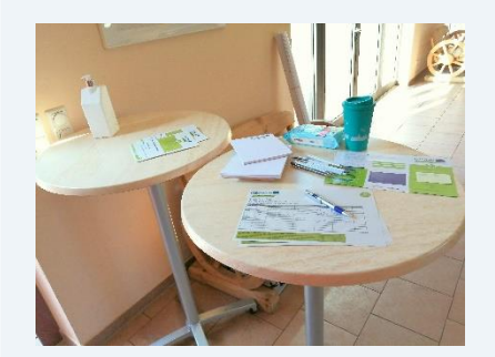
Workshop in Wittbrietzen