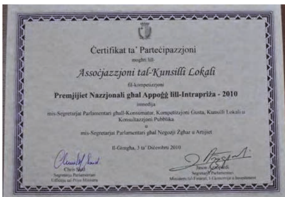
On the left : Certificate from the National Enterprise Support Awards 2010