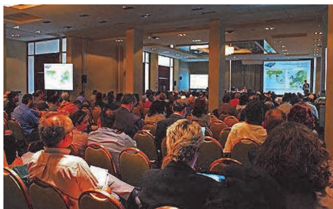
Plenary session of the MED programme annual conference