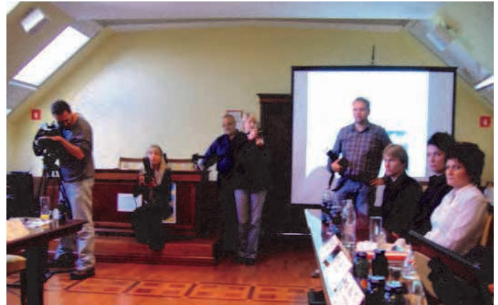
Journalists and photographers during the partners' press conference, with the potential creators on the right