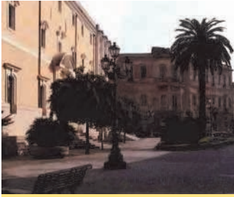
Eleonora d'Arborea Square in Oristano

At the end of the second call for proposals on the 14 th July 2010, we didn't receive any applications from potential entrepreneurs. For this reason, we decided to review some of the requirements for the participation in the call (considered too restrictive for potential entrepreneurs), such as the legal status, sectors previously too restrictive, unemployment status, compulsory residence of the potential entrepreneur in a municipality concerned by the project, too restrictive evaluation criteria, long evaluation procedures. On the 30 th June 2010, we changed the following requirements : free choice regarding to the legal form of business, more flexibility in the activities sectors by simplifying the economic categories, to eliminate the requirement of unemployment in order to allow a greater number of participants to apply, to establish evaluation criteria connected to the business idea rather than the socio-economic one. According to the second review, the promotion for the call was local : • by publishing article in a free newspaper distributed throughout the province, • by distributing documentation to different organisations in the province of Oristano (trade association, cooperative federation, industrial association, local employment service, etc.). After the new call for proposals and the different changes, thirteen potential entrepreneurs presented an application to create new businesses.