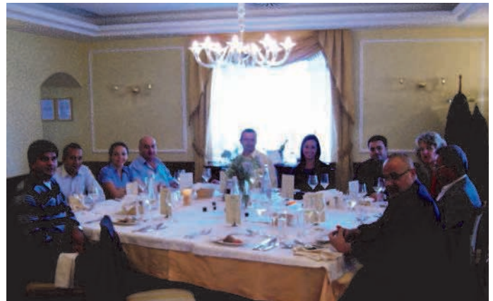
Partners' lunch in Ptuj