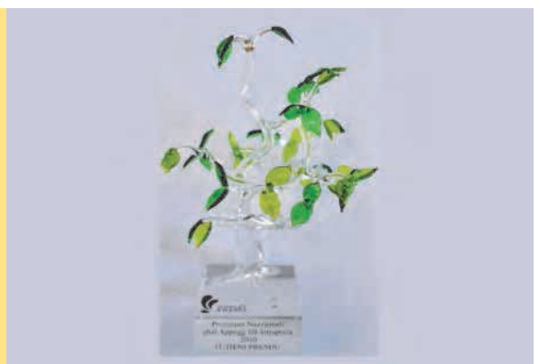
On the right : Second prize trophy