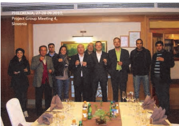
On the left : Philoxenia project partners during their meeting in Ptuj