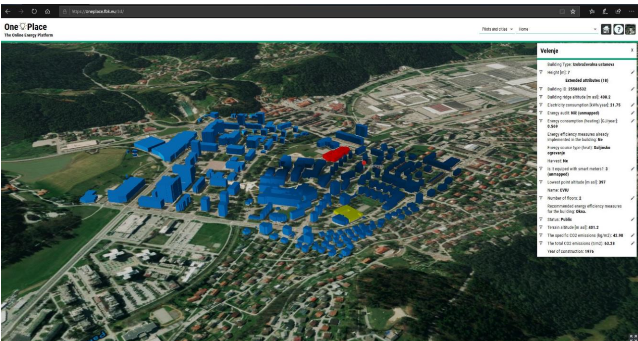
Velenje in OnePlace.