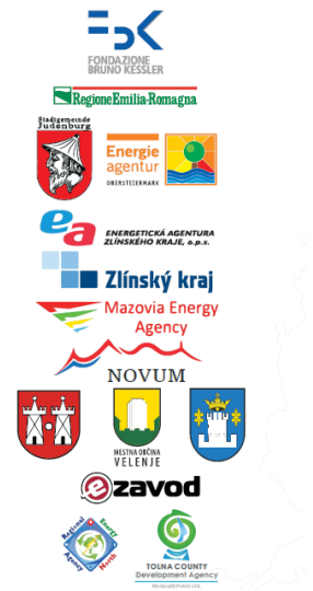
The final virtual meeting of the BOOSTEE-CE project partners.