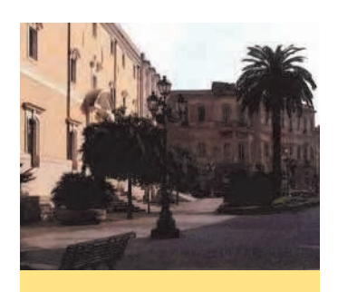
Eleonora d'Arborea Square in Oristano

t the end of the call for proposals on the 30th June 2010, we didn't receive any applications from potential entrepreneurs. For this reason, decided to review some of the requirements for the participation in the call (considered too restrictive for potential entrepreneurs), such as the legal status, sectors pretoo restrictive, unemployment status, compulsory residence of the potential entrepreneur in a municipality concerned by the project, too restrictive evaluation criteria, long evaluation pro-