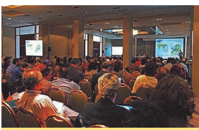
Plenary session of the MED programme annual conference